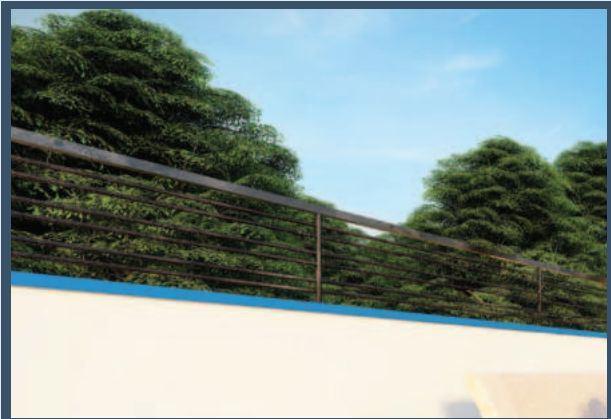
Outer Boundary Wall with Wire Fencing