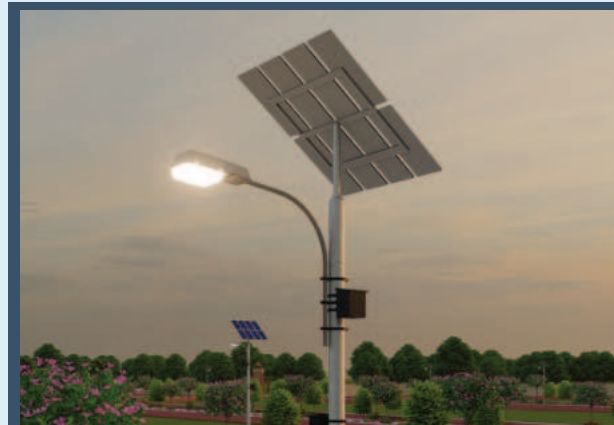
Solar Street Lights