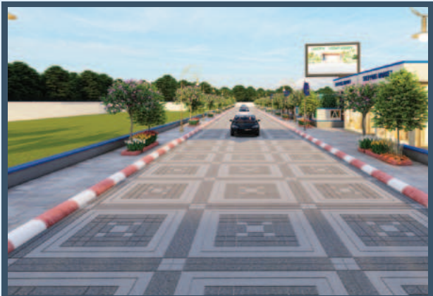
Interlocking Tiles Road