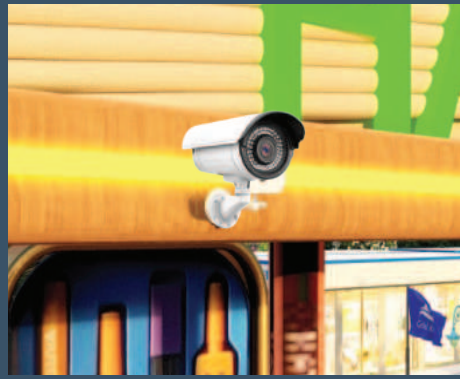
CCTV Surveillance (Only Entrance Gate)