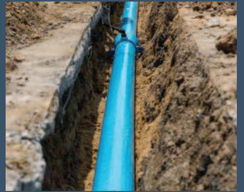
Underground Water Supply Pipeline