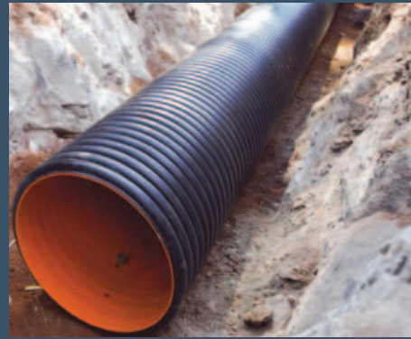
Underground Sewer Pipeline