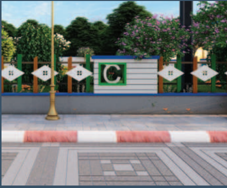
Park Boundary Wall