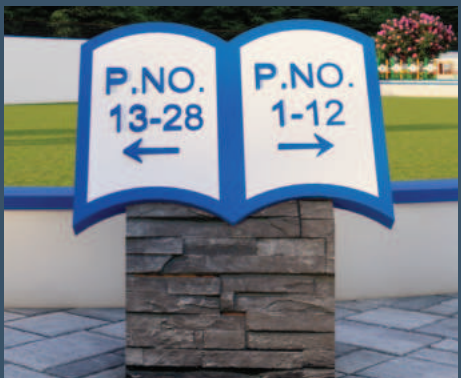
Arrow Plot Demarcation