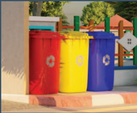
Garbage collection Box