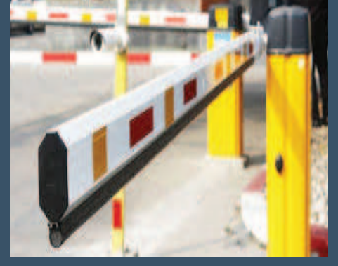
Automatic Boom Barrier