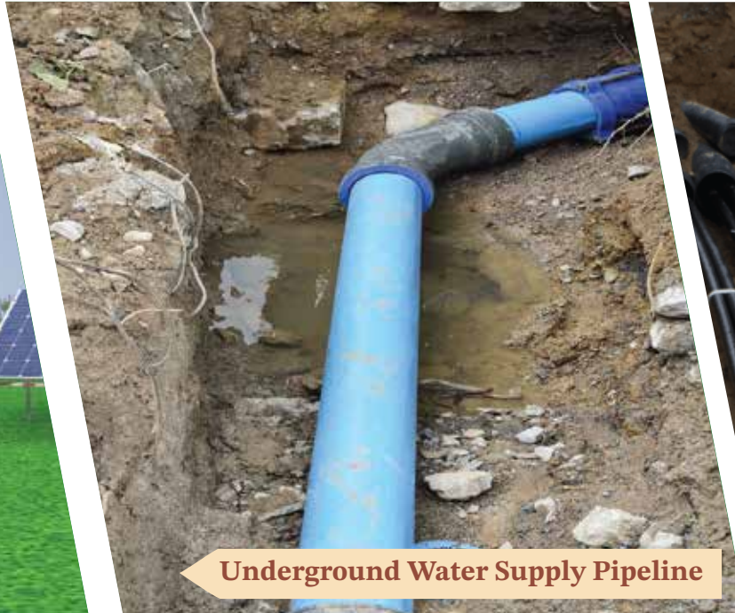
Underground Water Supply Pipeline