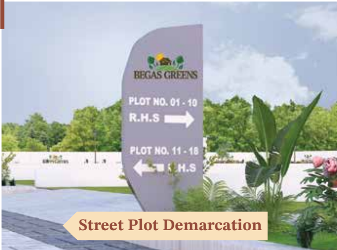
Street Plot Demarcation