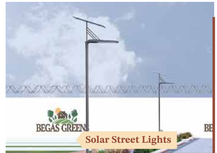
Solar Street Lights