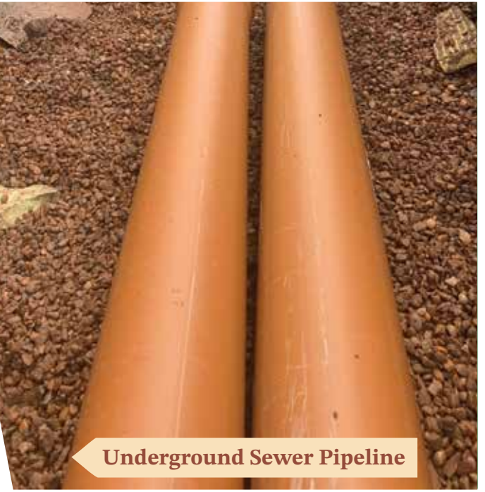
Underground Sewer Pipeline