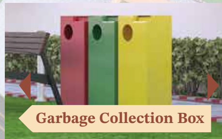
Garbage Collection Box