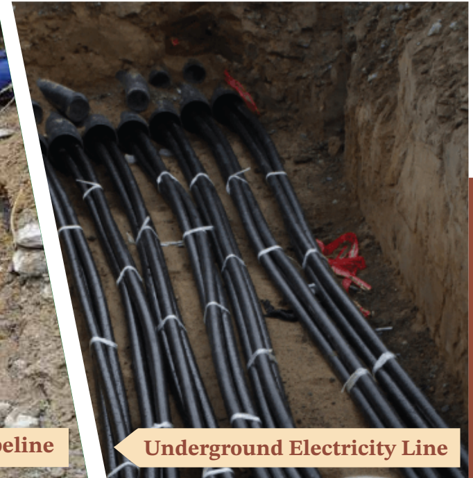
Underground Electricity Line