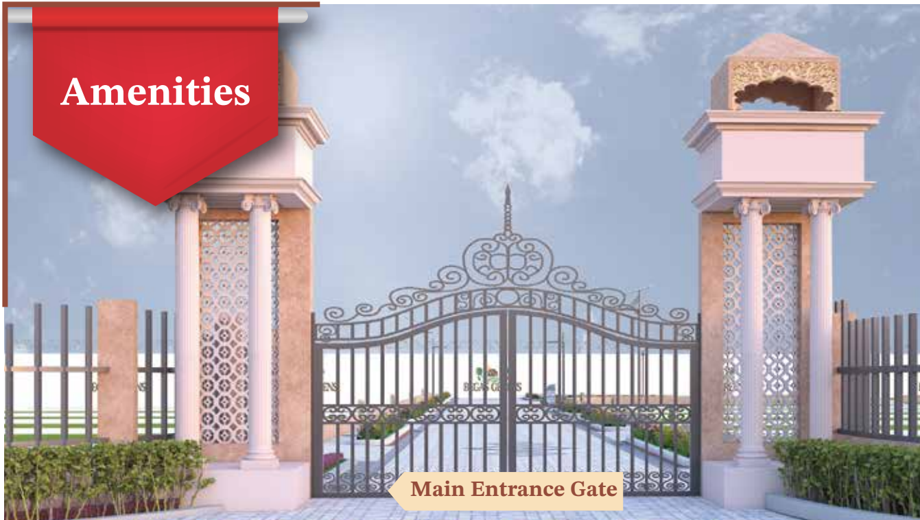
Main Entrance Gate