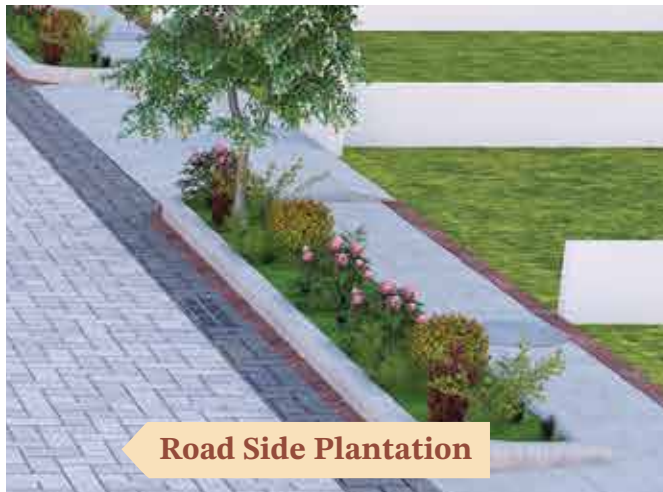
Road Side Plantation